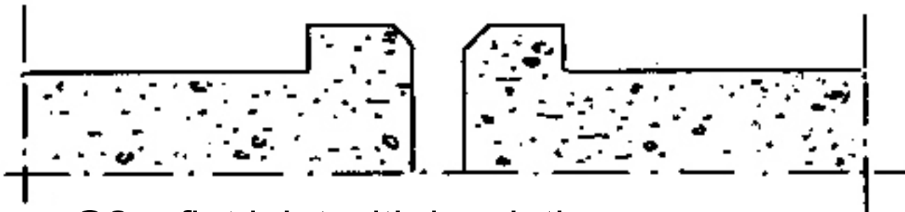
G2 – flat joint with insulation